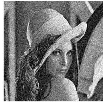
Fig. 3 - Gaussian noise

additive and it deals only with additive noise which is zero-mean. The principal source of Gaussian noise arises during image acquisition e.g. Sensor noise introduced by poor illumination or high temperature. This noise is known as the main part of the “real noise” in an image sensor, which is known as a constant noise level in dark areas of the image[40]. The image in Fig. 3 illustrates the effect of Gaussian noise on the original image