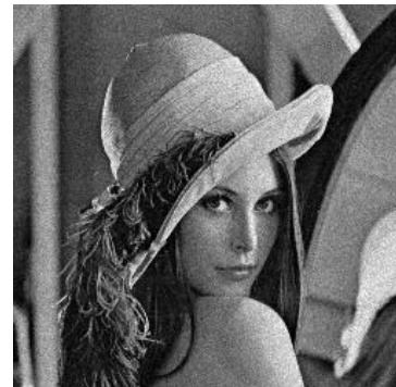
Fig. 4 - Poisson noise

(c) Poisson Noise is known as shot noise. It follows a distribution, which is closely related to Gaussian distribution. Statistical quality of electromagnetic waves caused it to show on the image. This kind of noise shows when the number of photons present in an image that are captured with the sensors are seemingly not strong enough to pinpoint statistical fluctuations in a particular measurement. The Fig. 4 shows Poisson noise on the original image.