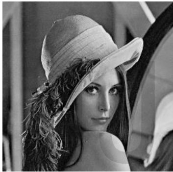
Fig. 2a - Original image

This is also called impulse noise, random noise or spike noise. This type of noise is caused by sudden and sharp changes of the image signal, faulty equipment, malfunctioning of the imaging device etc. It introduces itself as casually occurring black and white pixels that is, it will have bright pixels in areas that are dark while having in bright areas, dark pixels[5][14]. Salt and Pepper noise value that is meant to be 255 for 8-bit image is always 0. RGB images use 8-bit intensity ranges for each color and black and white images have a single 8-bit intensity range. The image in Fig. 2a shows the original image and Fig. 2b shows the effect of salt and pepper noise on the original image.