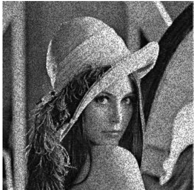
Fig. 5 - Speckle noise

gravity – capillary ripples, elementary scatters and present as a pedestal images which can be seen beneath the image of the sea waves. The noise in SAR is majorly more complex, because it causes difficulties for interpreting images[50]. It is depicted in Fig. 5