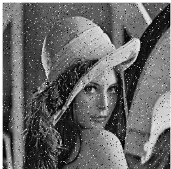
Fig. 2b - Salt and pepper noise

(b) Gaussian noise is also called amplifier noise. It is known as a statistical noise which has a Probability Density Function (PDF) which is commensurate to Gaussian distribution. It makes use of normal Gaussian distribution. It is usually either multiplicative or